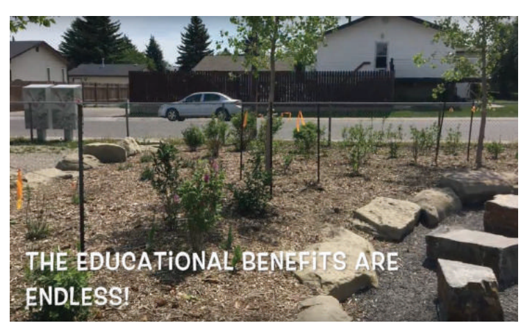
"Thank you Nutrients for Life and Inside Education for making our garden what it is"

-Teacher Hillcrest Public School Estevan, SK