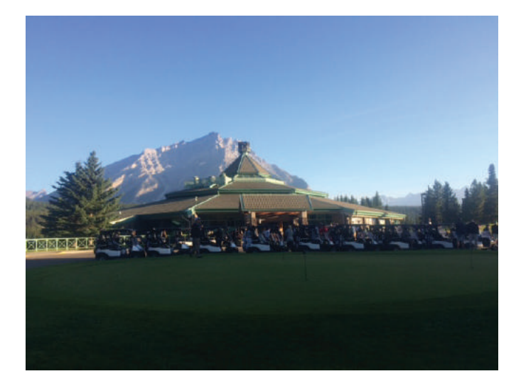
-We could not have asked for a more beautiful day and gorgeous setting for this years Charity Golf Tournament