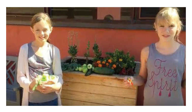
"Each class was able to have their own garden bed, which is really exciting"

-Teacher Hillcrest Public School Estevan, SK